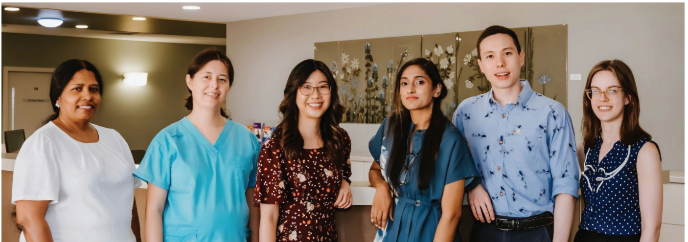
Mudgee Medical Centre's six new doctors

We're pleased to continue backing the work of Doctors 4 Mudgee whose work makes such a meaningful difference across the region.