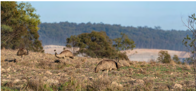
A family of emus have made their home in our rehabilitated land

Importantly, we believe that the transition to a net-zero emissions economy must balance the need for a timely transition with the necessity for affordable, reliable energy for Australia and other parts of the world.