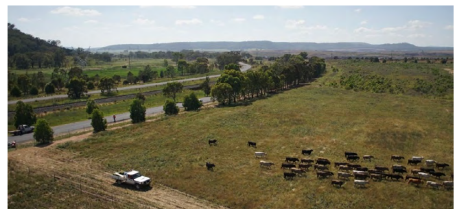
Tailings Dam after rehabilitation