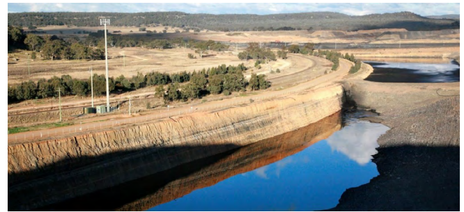
Tailings Dam, 2007